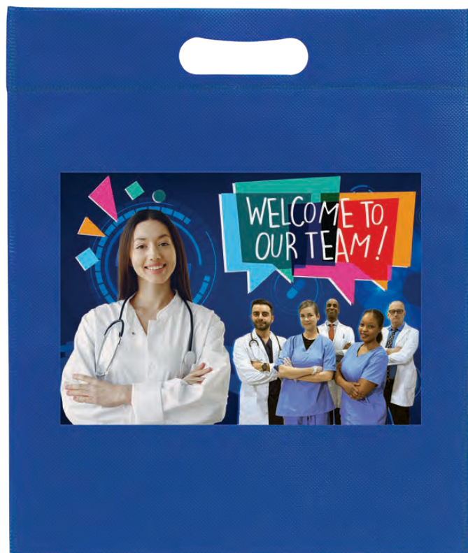
13W x 15H x 3 COLOR VISTA

Imprint Area: Front/Back – 8W x 8H (Screen Print) Front/Back – 10W x 7H (ColorVista & Sparkle) Front – 7W x 7H (Dynamic Color)